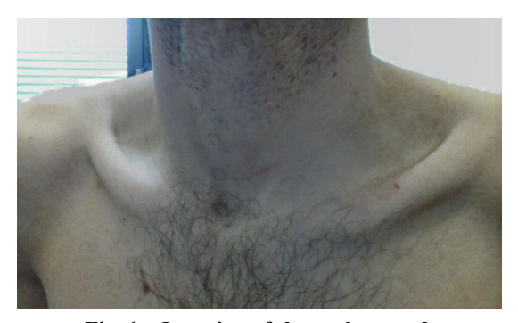
Fig. 1 – Location of the neck wound.

The patient was a 28-year-old male who was stabbed with broken glass penetrating the front side of the neck (zone I injury) the night before admission to our clinic. The next day the patient was examined at the Emergency Department in charge of surgical admissions at the Military Medical Academy in Belgrade. A linear 2 cm laceration was noted in the zone I of the neck with no active bleeding. There was an interruption of skin and subcutaneous tissue to the muscle layer (Figure 1). An otorhinolaryngologist performed rhinoscopy, oropharyngoscopy and indirect laryngoscopy to rule out any injuries of the ear, nose and throat region. Due to complaints of chest pain and dyspnea, a chest radiography (Figure 2) and MSCT of the thorax were taken. They revealed pneumomediastinum and hemopneumothorax on the left, as well as subcutaneous emphysema (Figure 3).